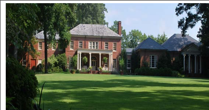
Mr. Dixon Home and Gardens of Memphis, TN. March 18, 2018.